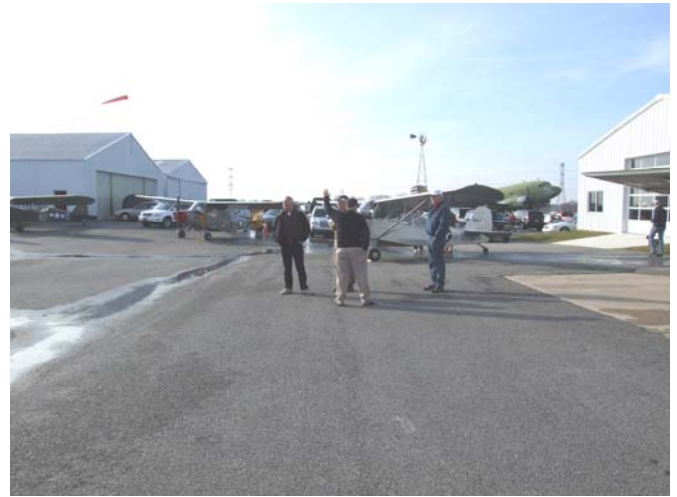
Look at that wind sock !