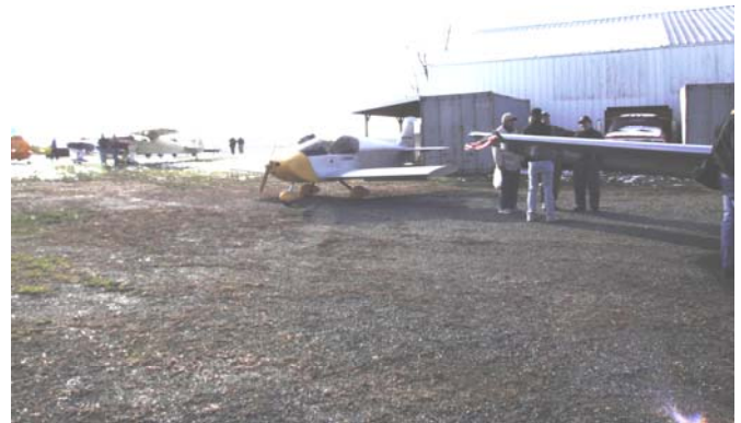
A Sonex flew in

Come to our Christmas Party Dec 16 th at Free Fall adventures hangar. Bring a friend!