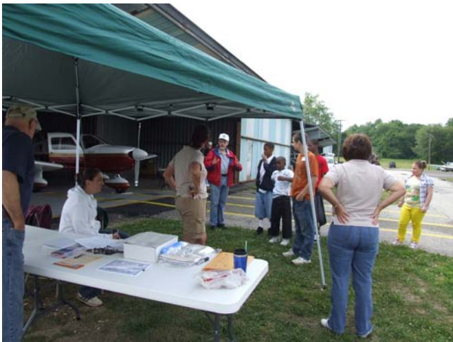
The Young Eagles Tent