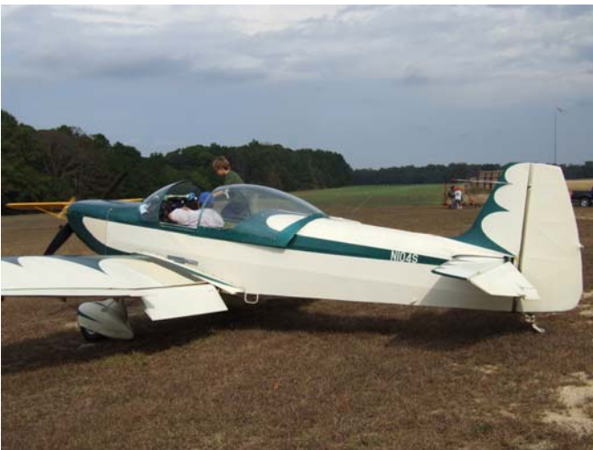
It sure looked good on that low pass Joe

The Fall Fest was a surprise winner. With the Rain predicted and competing events we didn't expect such a nice turnout. Joe flood flew in with a Mystery Plane, A Piel Emeraude. It had been sitting in a hangar for years until Joe spotted it.