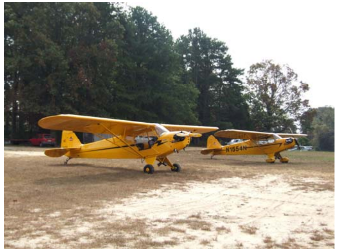
a couple of award winning Cubs